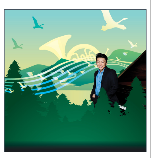
Rachmaninoff & Sibelius