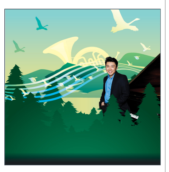
Rachmaninoff & Sibelius

The reworked symphony condenses the original four movements into three – Sibelius combined the first and second movements – and features a new finale. The Tempo molto moderato is textbook Sibelius, featuring brief, fragmentary ideas that surface somewhat enigmatically from the depths of the orchestra. A short melody in the horns later coalesces into a fully developed theme. At times the instruments seem to murmur to themselves; as the music progresses, the strings and brasses declaim bold proclamations.