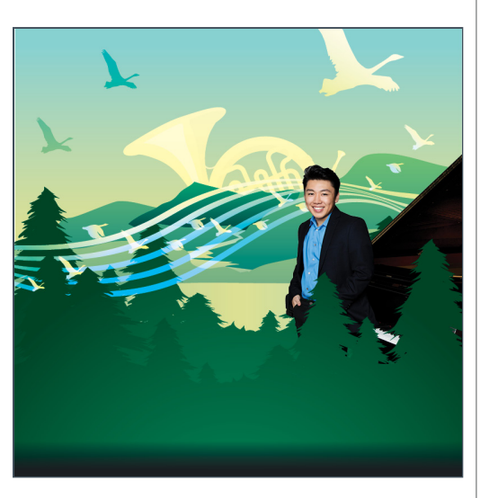
Rachmaninoff & Sibelius