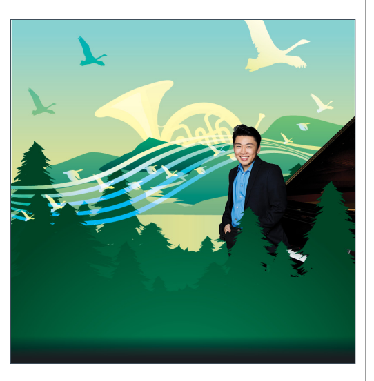
Rachmaninoff & Sibelius

Munich's Gasteig, the Louvre, Seoul Arts Center, Tokyo's Asahi Hall and Musashino Hall, NCPA Beijing, Shanghai Poly Theater, and Amici della Musica Firenze, as well as appearances at major festivals including the Edinburgh International Festival, Verbier Festival, Ravinia Festival, Vail Festival, Seattle Music Festival, La Jolla Festival, Festival de Pâques in Aix-en-Provence Festival, Colmar Festival, and Montreux Festival.