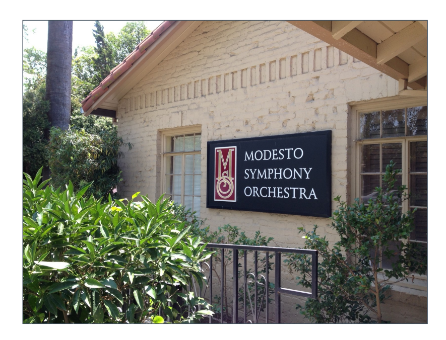
About the MSO