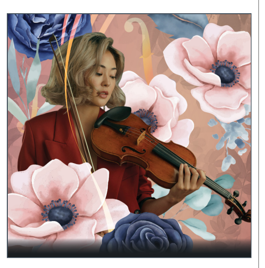
Barber & Brahms